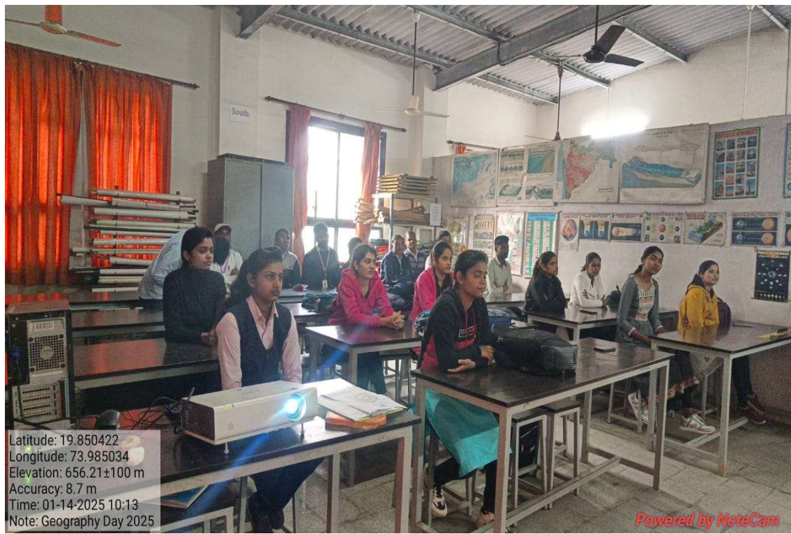
Students from the Geography Department present at the Geography Day program