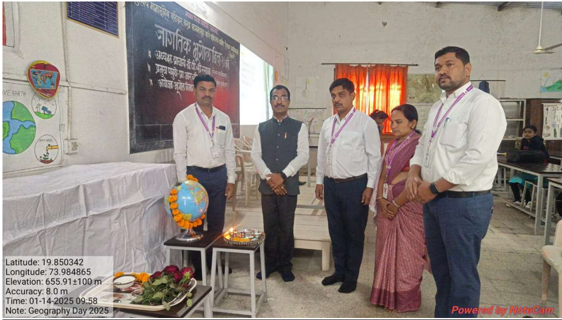
Worshipping the globe in the hands of the chief guest during the event