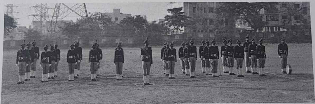
NCC cadets participation in the Republic Day Parade 2022